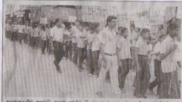
ஆலங்குடியில் சைல்டு லைன் சார்பில் பெண் குழந்தைகளுக்கு எதிரான பாலியல் வன் கொடுமை தடுப்பது குறித்த விழிப்புணர்வு பேரணி நடந்தது.